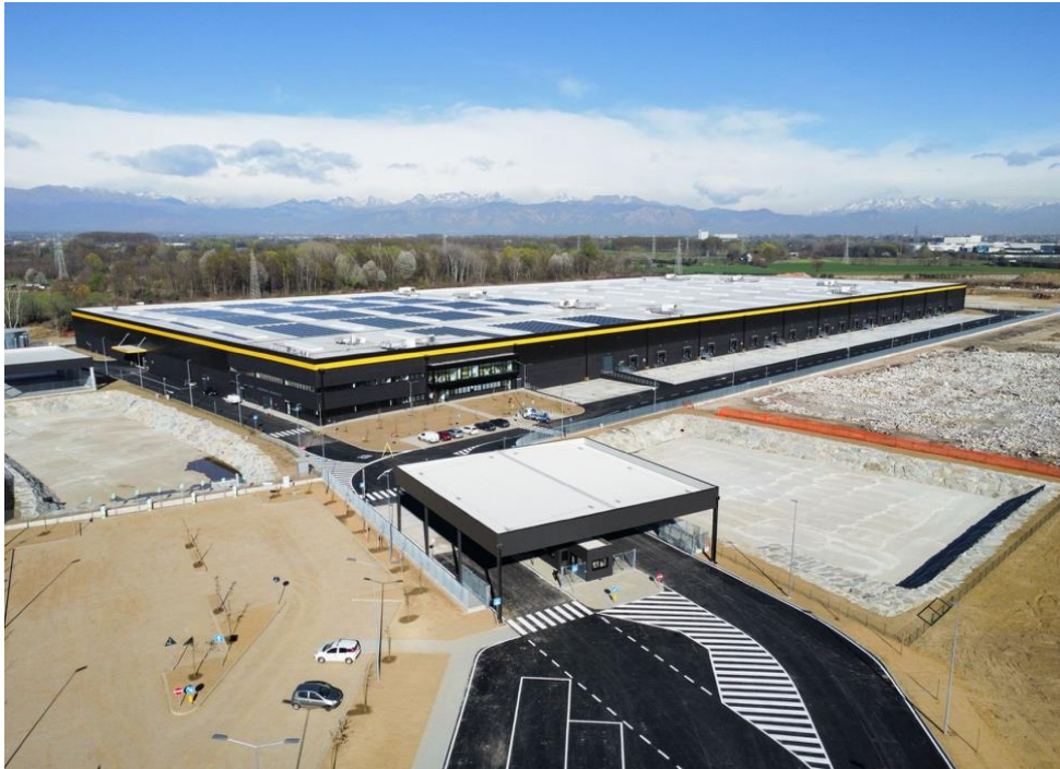
Settimo Torinese (TO) - Project realised for Kervis SGR, as manager of BGO Logistics Fund 1, fully invested by BentallGreenOak

The promotion of corporate well-being is a theme to which GSE has paid the utmost attention during this last year, through the renewal of its offices by equipping them with multifunctional spaces to encourage interaction and teamwork and a series of training programs for all employees for a total of 322 hours.