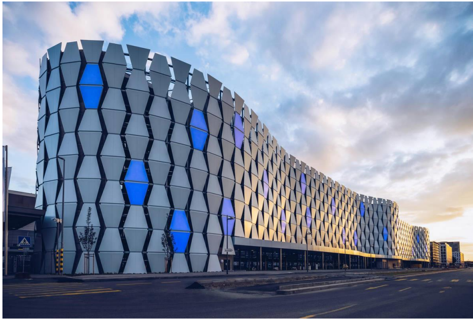
Frankfurt - Parking Goldbeck realized for Fraport Group