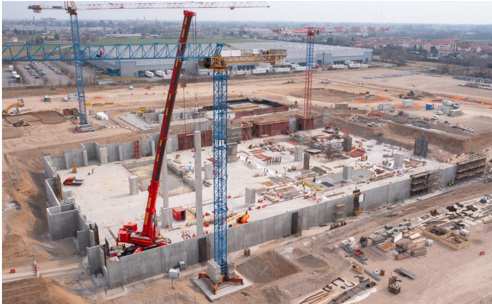
Boffalora Sopra Ticino (MI) - Ongoing project for Vetropack

Among the projects in progress, work continues for the construction of a modern industrial plant of 120,000 sqm in Boffalora Sopra Ticino (MI): a large urban regeneration project which, thanks to important environmental remediation interventions, has made it possible to recover an abandoned post-industrial area of over 330,000 sqm along the Naviglio Grande. The new plant will be integrated with offices and multi-level automated warehouses, in line with the strictest environmental sustainability standards applied to industry and urban reconversion and in full respect of the context and social memory.